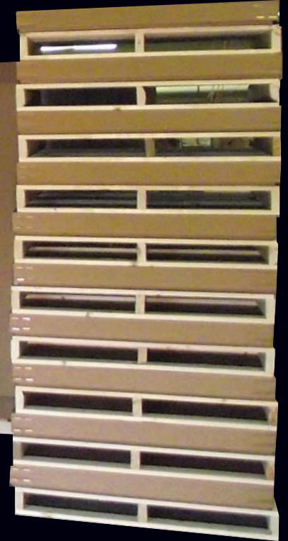
Stack Liftvan 50s 10 high for shipment.